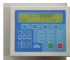
Machine Control Console