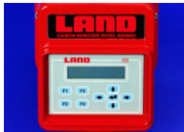
User keypad and CO measurement display