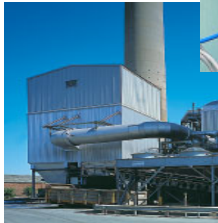
Opacity monitoring on a municipal waste incinerator

The patented dual LED technology of the Model 4200 has proven itself worldwide as stable, reliable and trouble free. The lightweight and compact design makes it ideal for a wide range of applications. Simple installation, low maintenance and ease of operation ensure immediate results - vital where performance, cost and compliance benefits are of high priority.