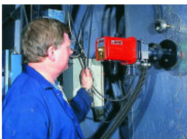
Dust monitoring on a coal-fired boiler

The instrument alternates between the measurement and flood LEDs every second to eliminate drift and maintain accuracy.