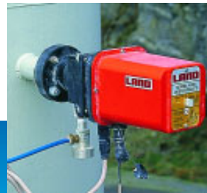
Dust monitoring on a roadstone coating plant