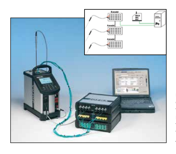
Picture 3: 2 ASM A models connected to the ASM B model, in order to obtain 24 channels. In this set-up the JOFRA ATC B model is used as a dry-block with the reference sensor connected to the reference input of the ATC. All controlled by JOFRACAL.