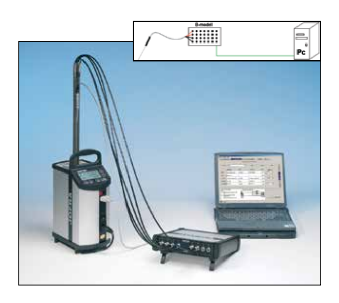
Picture 2: ASM-803 B performing its own measurements in a JOFRA ITC-320 A including an STS reference sensor in channel one all controlled by JOFRACAL.