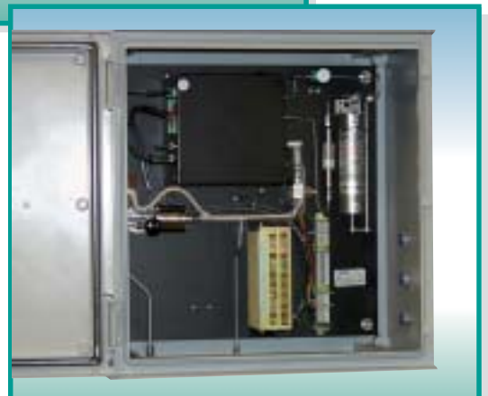
Model 3050-OLV in a black box configuration, top NEC Class I, Division 1/CENELEC Zone 1 explosion-proof enclosure, center NEMA 4X weather-proof enclosure, bottom