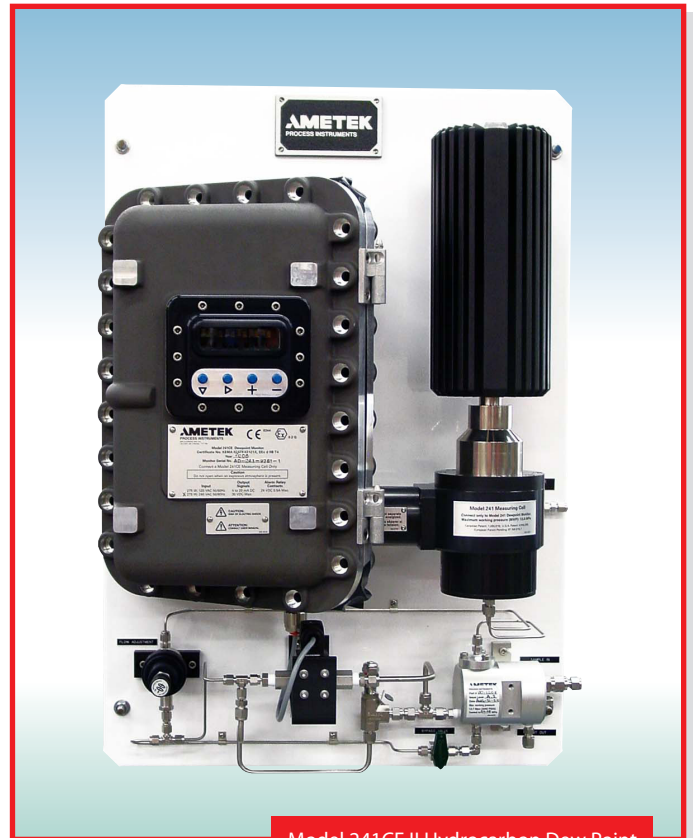
Model 241CE II Hydrocarbon Dew Point Analyzer - European version shown

A fully integrated sample system package, including proprietary multiple stage filtration specifically designed for natural gas samples, protects the analyzer from common natural gas contaminants (aerosols, particulates and liquid slugs) and ensures reliable, fast, and accurate means of detecting the hydrocarbon dew point temperature in natural gas applications.